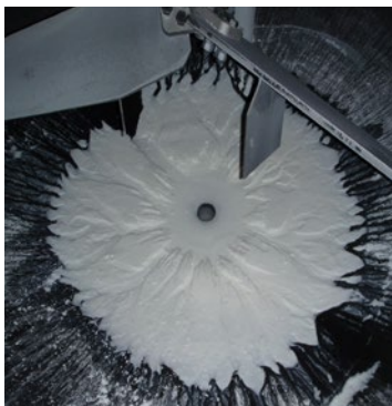
A310 kicker to the left, product still visible in tank.

In one case, a solids heel was reduced 98.9% by adding the KT-3. The KT-3 is patented by Dow Chemical and licensed for sale exclusively by Lightnin.