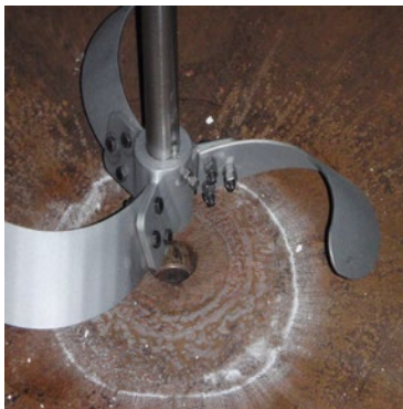
KT-3 kicker to the left, no product left in tank.