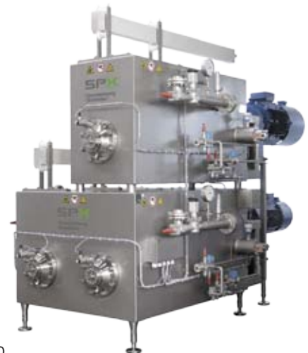
GS Kombinator 250

This solution with the Gerstenberg Schröder brands makes it possible to produce shortening continuously with a constant high quality within a very short period of time and minimal investment and production costs.